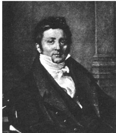
Jacob-Michel-François de Candolle, one of the founders of the bank